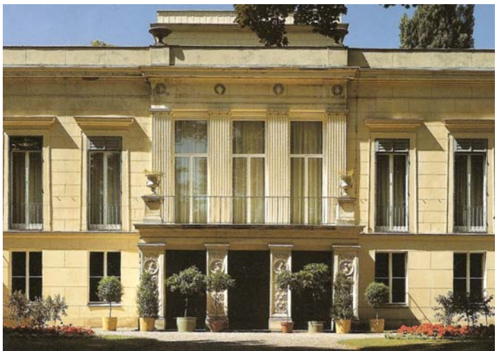
(Top) Schloss Sanssouci. (Bottom) Casino, Klein-Glienicke

Tour arrangements by Classical Excursions P.O. Box 724 Stockbridge, MA 01262 Tel: 800-390-5536