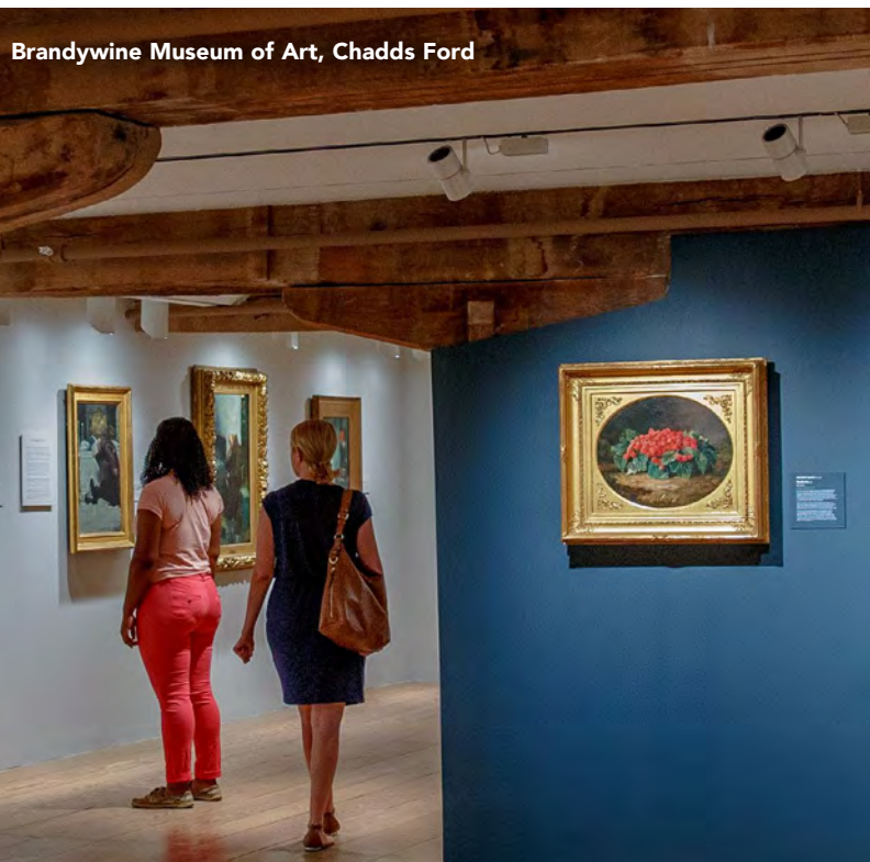
Brandywine Museum of Art, Chadds Ford

Enjoy breakfast and transfer independently for your return home at your leisure. B