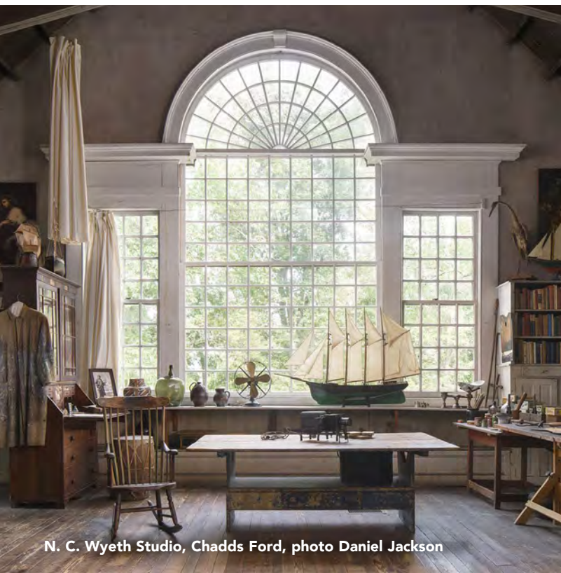
N. C. Wyeth Studio, Chadds Ford

Travel to the small village of Chadds Ford to experience the preserved creative spaces of father-son American masters: N.C. Wyeth's 1911 studio with its enormous north-facing windows, where he created paintings and popular children's book illustrations; and his son Andrew Wyeth's converted schoolhouse workspace where his paintbrushes, pigments, and personal collections remain exactly as he left them.