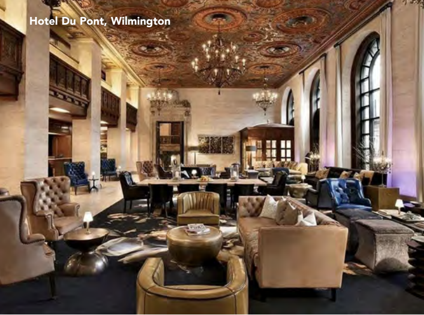
Hotel Du Pont, Wilmington

Adorned with terracotta flourishes and gleaming marble floors, this dazzling hotel opened as a wing of the DuPont Company headquarters in 1913. More than 100 French and Italian craftsmen spent 27 months carving, gilding, and painting its spectacular Gold Ballroom and opulent public spaces. Each of the hotel's guest rooms preserves its aristocratic Gilded Age grandeur, from the soaring 12-foot coffered ceilings to the original Spanish Revival-style wood doorways, making it one of the finest surviving examples of American Beaux-Arts architecture in the early 20th century.