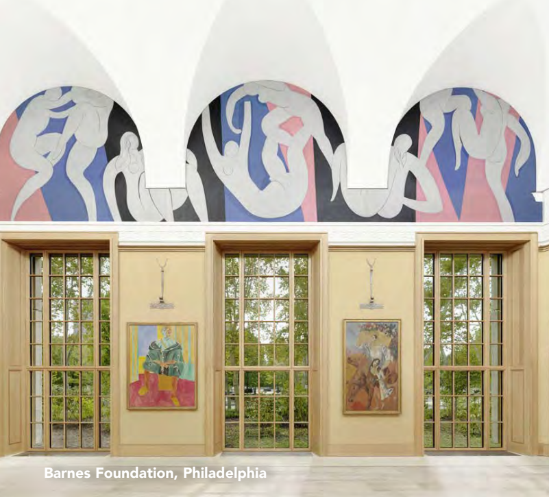
Barnes Foundation, Philadelphia